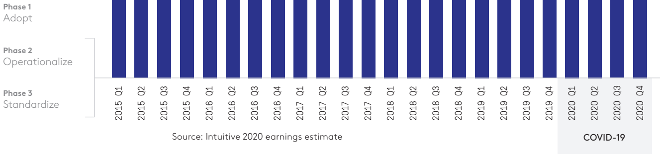
Global Growth in IDNs with 7+ da Vinci Systems

Reflecting on the year, our customers value our products and appreciate our broad support. As COVID constraints on hospitals ease, hospitals return to the use of our products. For the year, approximately 1.25 million procedures were performed, 1% growth compared to 2019. On a quarterly basis, year-over-year, procedures grew 10% in Q1 2020, decreased 19% in Q2 2020, grew 7% in Q3 2020, and grew 6% in Q4 2020. Throughout the year, customers continued to invest in new Intuitive systems, in anticipation of recovery after the pandemic. Our clinical installed base of da Vinci systems grew 7% year-over-year. Trends that stood out in capital placements included the increased acceptance of leasing and alternative capital placement models, as well as trade-ins of older da Vinci systems for our fourth-generation products – da Vinci X and Xi. Like last year, we continued to see committed customers become more so, with the growth of da Vinci systems in hospitals and integrated delivery networks (IDNs) continuing despite the pandemic, as shown in the chart below.